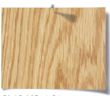
Cabot's Deck & Exterior Stain