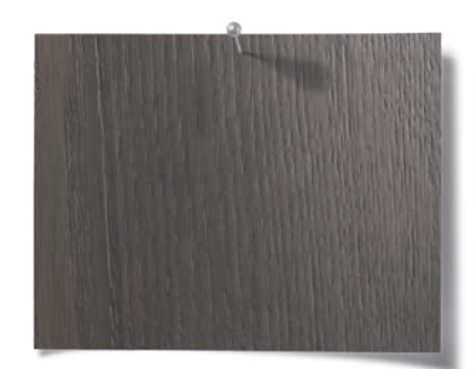
Intergrain Natural Stain Charcoal