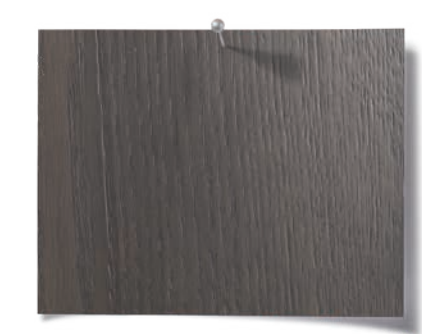
Intergrain Natural Stain Ebony