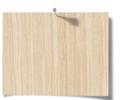
Intergrain UltraClear Exterior